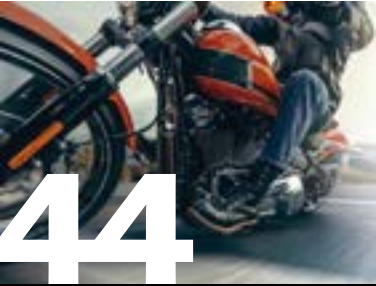
Cruise & traction control