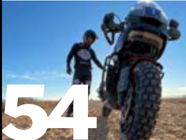
From rally to road