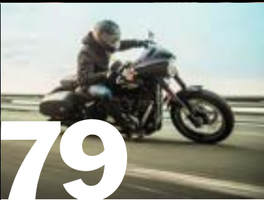
H-D® Certified™ Approved Used