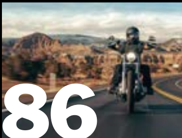
Test Ride Booking