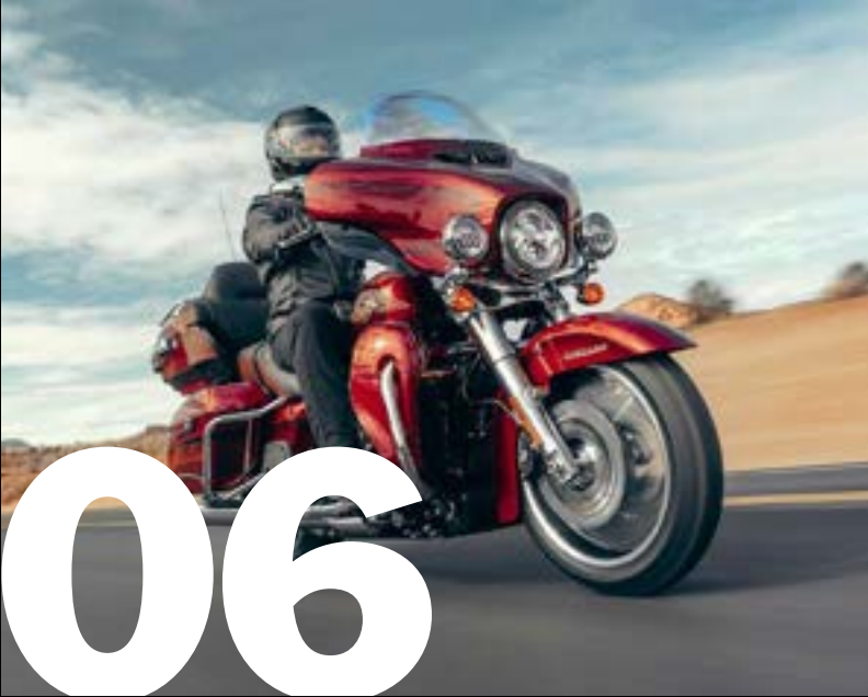
120th Anniversary models lineup