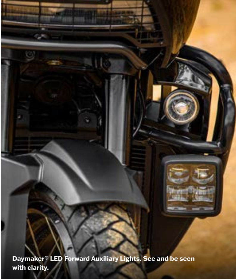
Daymaker® LED Forward Auxiliary Lights. See and be seen with clarity.

Owning and riding a Pan America™ is just the start of your next adventure. Make sure you're equipped with Harley-Davidson® Genuine Parts & Accessories and riding gear before you start exploring. Night or day. Hot or cold. Smooth roads or off-road mountain tracks. You'll find everything you need at your local H-D® dealership.