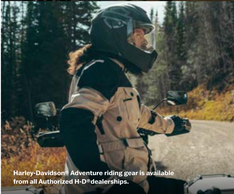
Harley-Davidson® Adventure riding gear is available from all Authorized H-D® dealerships.