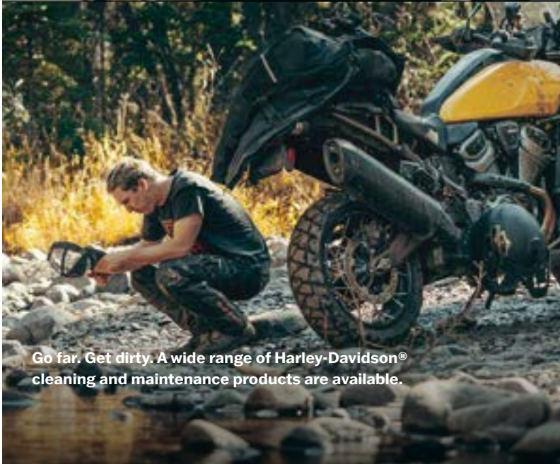
Go far. Get dirty. A wide range of Harley-Davidson® cleaning and maintenance products are available.