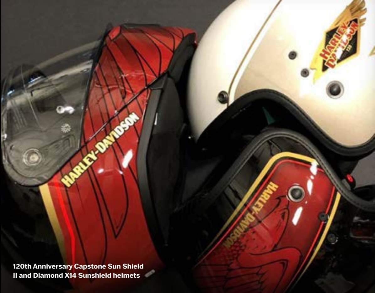
120th Anniversary Capstone Sun Shield II and Diamond X14 Sunshield helmets