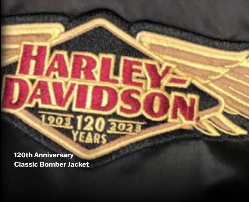
120th Anniversary Classic Bomber Jacket