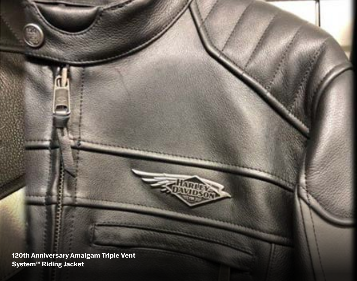
120th Anniversary Amalgam Triple Vent System™ Riding Jacket