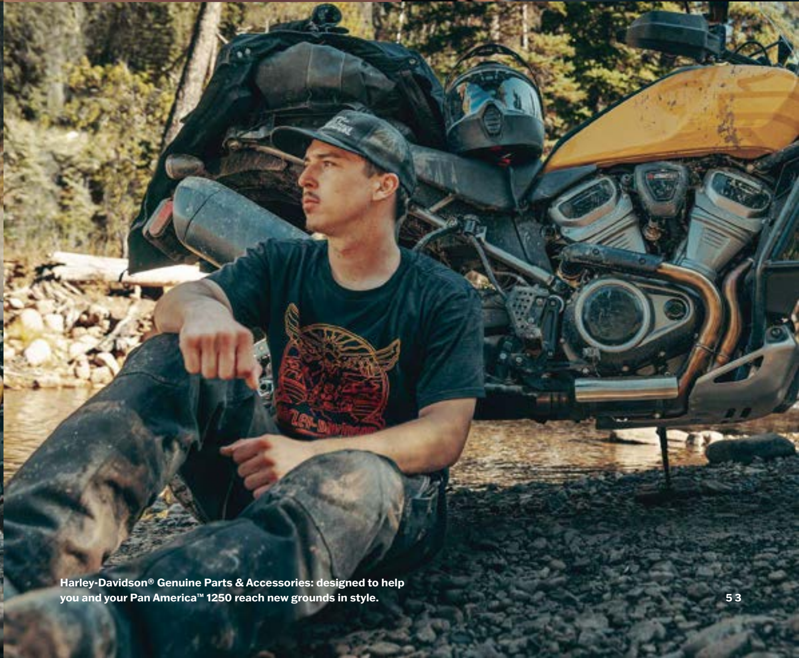
Harley-Davidson® Genuine Parts & Accessories: designed to help you and your Pan America™ 1250 reach new grounds in style.