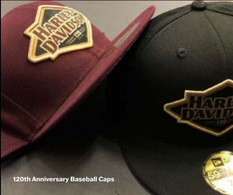
120th Anniversary Baseball Caps