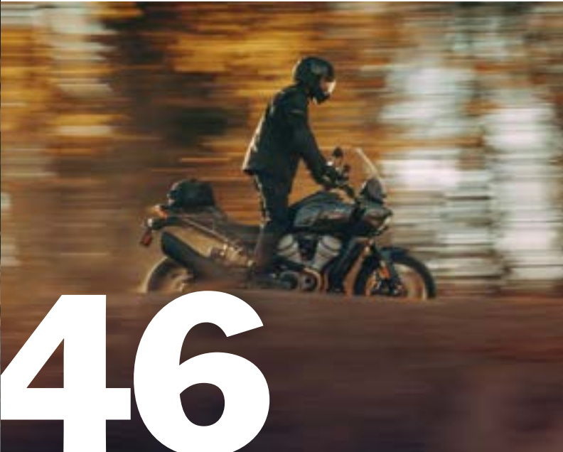
Adventure Touring lineup