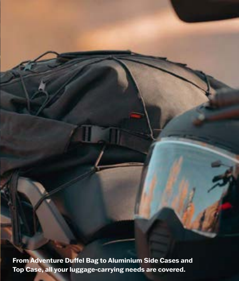
From Adventure Duffel Bag to Aluminium Side Cases and Top Case, all your luggage-carrying needs are covered.