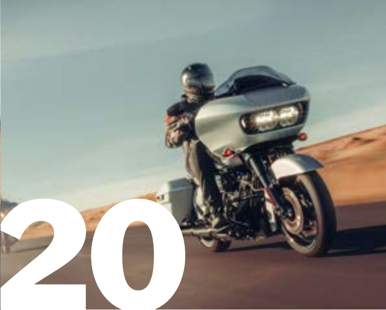
Grand American Touring lineup