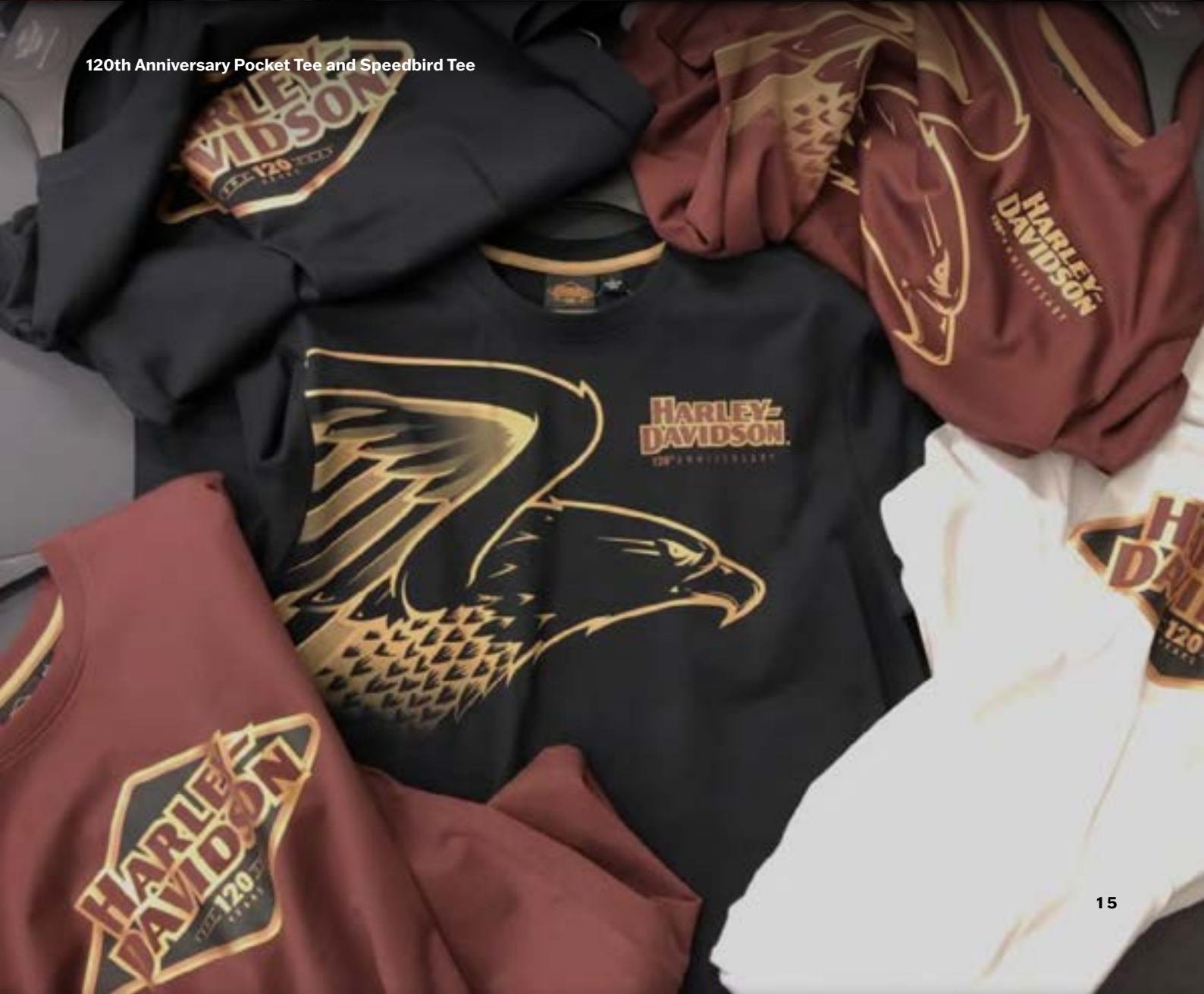
120th Anniversary Pocket Tee and Speedbird Tee