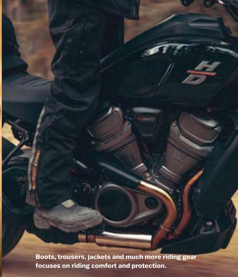
Boots, trousers, jackets and much more riding gear focuses on riding comfort and protection.